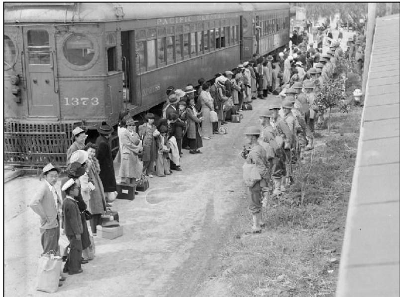
Japanese Americans from San Pedro, California, guarded by soldiers arrive at Santa Anita Racetrack, a temporary detention center, in Arcadia, California, in 1942. (Photo from National Archives).

During WWII, the U.S. government used euphemistic language to control public perceptions about the forced removal of Japanese American citizens from their West Coast homes to desolate American concentration camps further inland. The public was told that Nisei and Issei (non-citizens) were being “evacuated” to “relocation centers” and “internment camps.” Terms like “evacuation” of people sounded like they were being rescued from some kind of disaster (like an earthquake). To obscure the unconstitutional nature of these forced removals, the government referred to the Nisei victims as ‘non-alien’ instead of ‘citizens’, which might provoke public inquiries like: “ Why is the U.S. imprisoning citizens’ without due process of law? ” Once in camp, Nisei could earn back their citizenship by embracing their “right” to defend their country and to serve on the “same basis” as other Americans in the military (but in the segregated U.S. Army 442nd Regimental Combat Team) (Lyon, 2012).