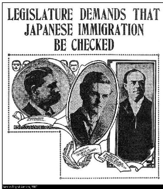
Headline from the San Francisco Chronicle on March 3, 1905. (Densho Digital Archive 2008)

While many of the 19 th century Japanese visitors to the U.S. were sojourners seeking adventure, education, and even economic opportunities, little did they anticipate that if they decided to stay permanently in this country, any move towards naturalization would be barred by an Act of Congress passed in 1790, which allowed only ‘free white men’ to be naturalized (Chuman, 1976). The Chinese Exclusion Act of 1882 aided (by favoring) Japanese immigration to America, but not for long (Takaki, 1989). In early 20 th Century, California passed its Alien Land Law (1913), which used the indefinite alien status of Japanese and other Asians to prevent them from acquiring real estate, and setting down permanent roots. The California law was soon mimicked by other western states (Chuman, 1976). Japanese and other Asian immigration was finally turned off by the passage of the U.S. Immigration Exclusion Act of 1924. Japanese immigration was halted until the 1952 passage of the McCarran-Walter Act. This historic act allowed Issei (Japanese immigrants) to become naturalized for the first time and allowed immigration to resume (at 185 Japanese persons per year), now without constraints to a person’s country of origin (Maki, Kitano, & Berthold, 1999).