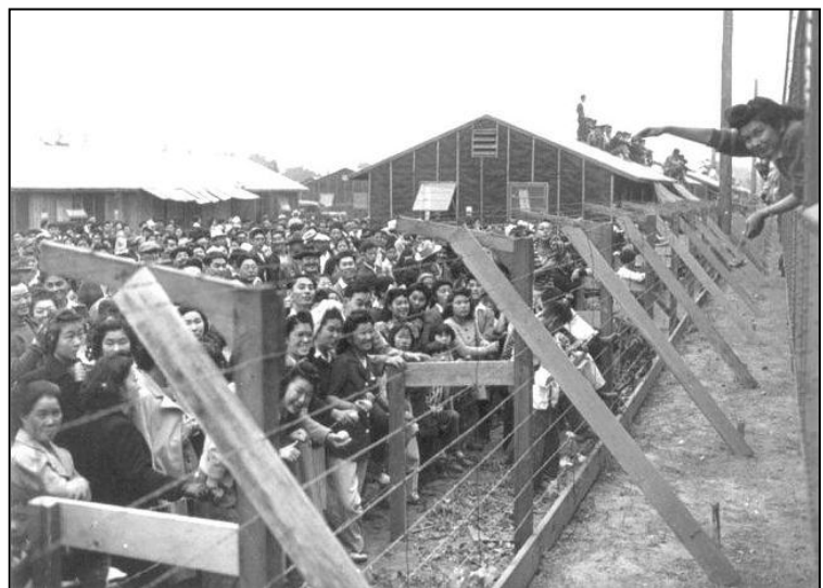
Japanese Americans behind the barbed wire fence in Santa Anita Race Track, a temporary detention center, waving goodbye to friends leaving by train for other incarceration camps.

When many Japanese and Japanese Americans were initially forced to leave their homes, they were directed to live temporarily in “assembly centers”—officially “Wartime Civil Control Administration” camps. (The WCCA was essentially a branch of the U.S. Army.) These make-shift detention facilities were often crudely fashioned from animal stalls at racetracks and fair grounds, still emitting the stench of animal waste but surrounded by barbed wire and search lights with armed soldiers to contain the people of Japanese descent. The euphemistic nature of this term hid the degrading lack of amenities and very crude living spaces in these facilities. For example, on December 18, 1944, Supreme Court Justice Owen J. Roberts stated that “an ‘Assembly Center’ was a euphemism for a prison...so-called ‘Relocation Centers,’ a euphemism for concentration camps” (Ishizuka, 2006, p. 72).