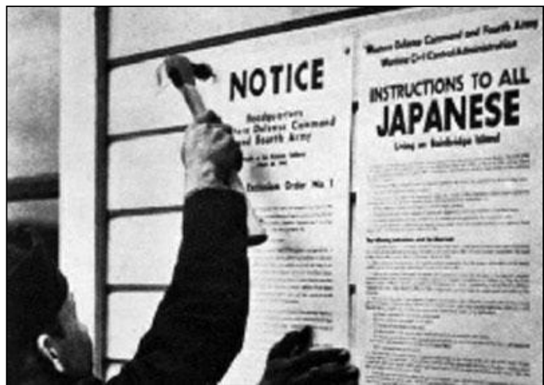
Soldiers and police posted President Roosevelt's February 19, 1942 Executive Order #9066 requiring the expulsion of Japanese Americans from the West Coast. Posters included euphemisms like "evacuation" and "Assembly Centers".

Pursuant to E.O. 9066, notices of military zones were publicly posted, which defined where Nikkei could be or not be present, along with special curfew hours prohibiting freedom of movement from dusk to dawn (see Fig. at right). Within weeks there followed public instruction notices telling people of Japanese ancestry that they had less than one week to dispose of their property and belongings (except for a short list of portable personal items) and prepare for an indefinite leave. These 'evacuation' notices directing 'non-alien' to 'assembly centers' by a target date, seemed innocuous for what they really were, namely: federal orders to American citizens for their forced removal from private homes to government detention facilities and on very short notice . After being detained several weeks to months in temporary facilities (which included converted animal stalls at racetracks), the inmates were shipped under armed guard by trains to American concentration camps, which were called 'relocation centers' run by the War Relocation Authority (WRA--another euphemistic agency name) (Burton, Farrell, Lord, & Lord, 1999).