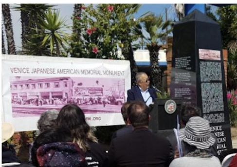
Warren speaks at the Commemoration in 2019

Much-appreciated, tax-deductible donations can be sent to: